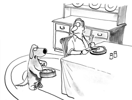
"Excuse me, EXCUSE ME, what's that you are eating?!"