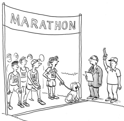
"Can't take my dog?! But I don't even know HOW to run without my dog!"