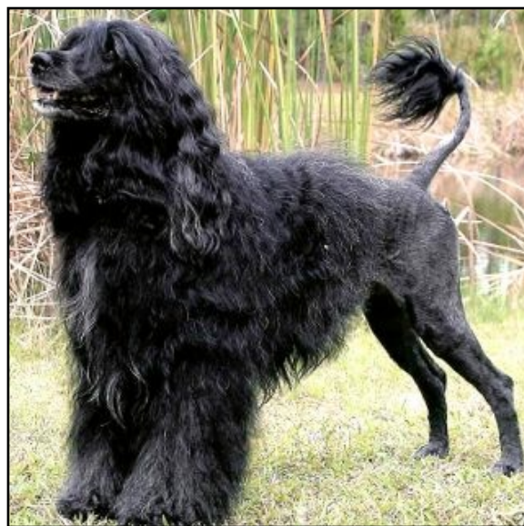
CH Torrid Zone Treasure Fever CD, RN, JWD