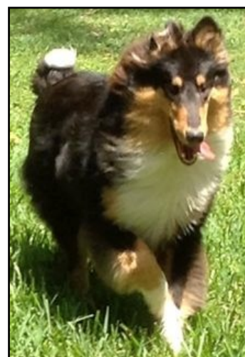
Ceilidh's Dark Soldier "Trooper"