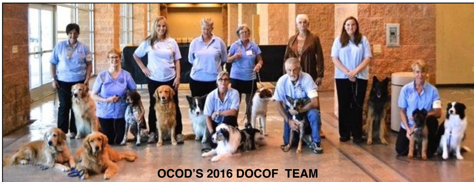
OCOD'S 2016 DOCOF TEAM